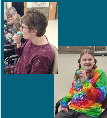
Dr. Seuss Day (green eggs to celebrate!)